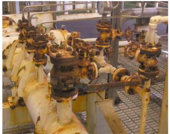
Above: a typical view of corroding flanges and valves on a North Sea platform.

Using Enviropeel to protect vulnerable offshore systems not only fulfills the HSE's preferred prevention option but it provides operators and dutyholders with a long-term solution to the need for constant inspection and maintenance of both safety-critical and non-safety critical elements. In most of