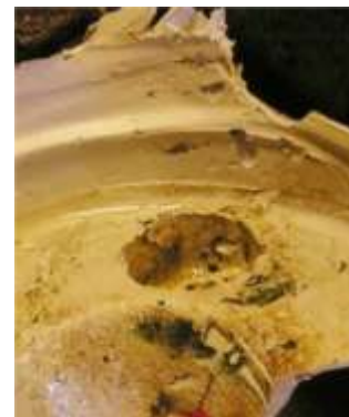
Above: after two years, an application on a flange with severely corroded bolts is cut away for inspection. No further corrosion has taken place and inhibiting oil can be seen on the fastening and in the removed Enviropeel coating.