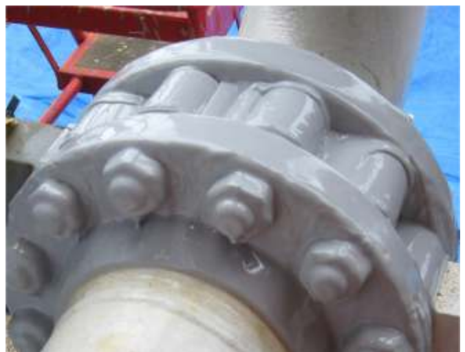
Below: a typical flange, perfectly encapsulated with Enviropeel to preserve its integrity.